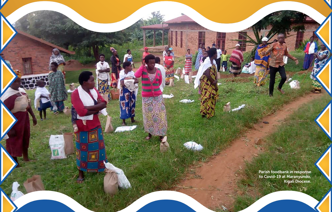
Parish foodbank in response to Covid-19 at Maranyundo, Kigali Diocese.